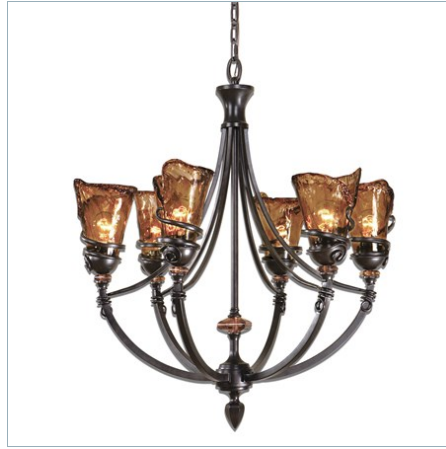
VITALIA, 6 LT CHANDELIER