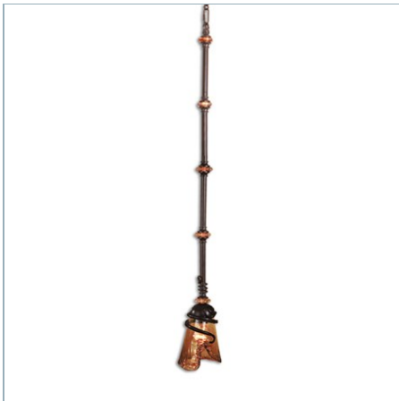
VITALIA, 1 LT MINI PENDANT