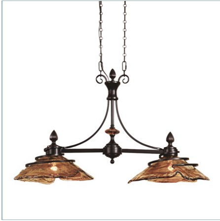
VITALIA, 2 LT KITCHEN ISLAND