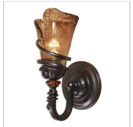
VITALIA, 1 LT WALL SCONCE