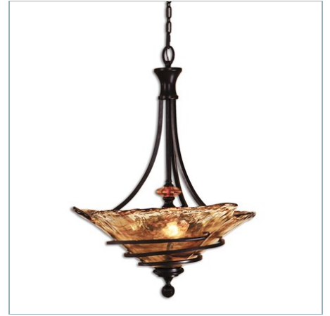
VITALIA, 3 LT PENDANT