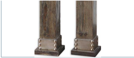
LICAN CANDLEHOLDERS, S/2