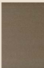
EB European Bronze