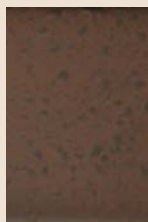
RI Rustic Iron