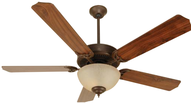
Aged Bronze CD Unipack with 52" Contractor's Design Walnut Blades and Bowl Kit

Model-Finish CDU202AG Blade-Finish BCD52-WB6 Light-Finish Included