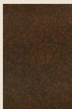
AG Aged Bronze