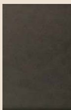
OB Oiled Bronze