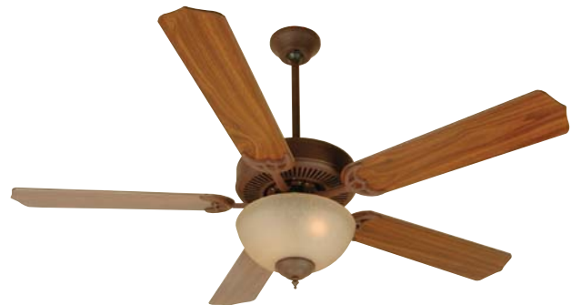
Rustic Iron CD Unipack with 52" Contractor's Design Walnut Blades and Bowl Kit

Model-Finish CDU202BS Blade-Finish BCD52-WWB Light-Finish Included