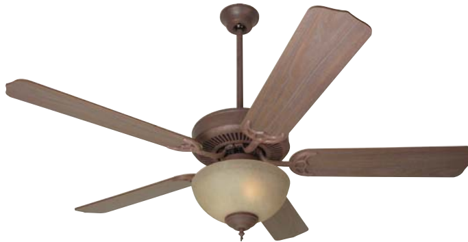
Brownstone™† CD Unipack with 52" Contractor's Design Washed Walnut Birch Blades and Bowl Kit

Model-Finish CDU202EB Blade-Finish BCD52-WWB Light-Finish Included