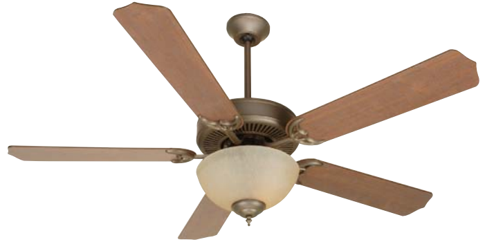
European Bronze CD Unipack with 52" Contractor's Design Washed Walnut Birch Blades and Bowl Kit

Model-Finish CDU202AG Blade-Finish BCD52-WB6 Light-Finish Included