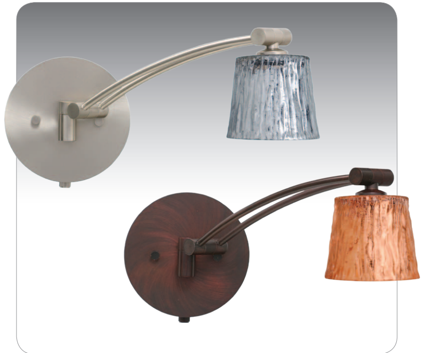
NICO 3 SWING ARM SHOWN IN "WW" STONE SILVER FOIL (1WW-5145SFSN) & "WW" STONE COPPER FOIL (1WW-5145CF-BR) IN BRONZE FINISH

UL or ETL Listed. Suitable for Damp Locations (interior use only).