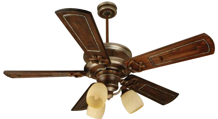
Dark Coffee/Vintage Madera Woodward with 54" Custom Carved Woodward Walnut Blades and Light Kit

Model-Finish WD52DCVM Blade-Finish B554P-CH9 Light-Finish Not Shown