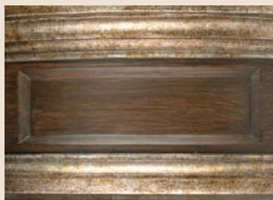
DCVM Dark Coffee Vintage Madera