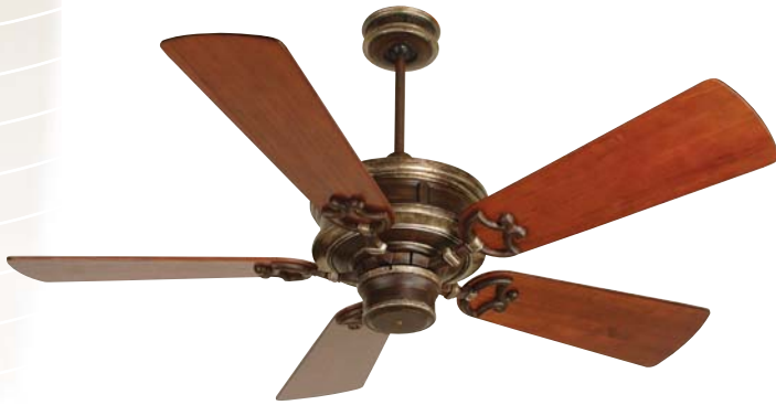
Dark Coffee/Vintage Madera Woodward 54" with Premier Hand-Scraped Cherry Blades

Model-Finish WD52DCVM Blade-Finish B554P-CH9 Light-Finish Not Shown