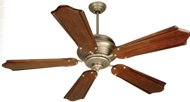
Pewter Townsend with 56" Custom Carved Classic Ebony Blades

Model-Finish TS52PT Blade-Finish B556C-SB4 Light-Finish Not Shown