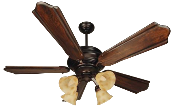
Oiled Bronze Townsend with 56" Custom Carved Classic Ebony Blades and Fitter/Glass

Model-Finish TS52PT Blade-Finish B556C-SB4 Light-Finish Not Shown